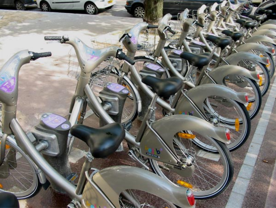
Bike rental system in Paris