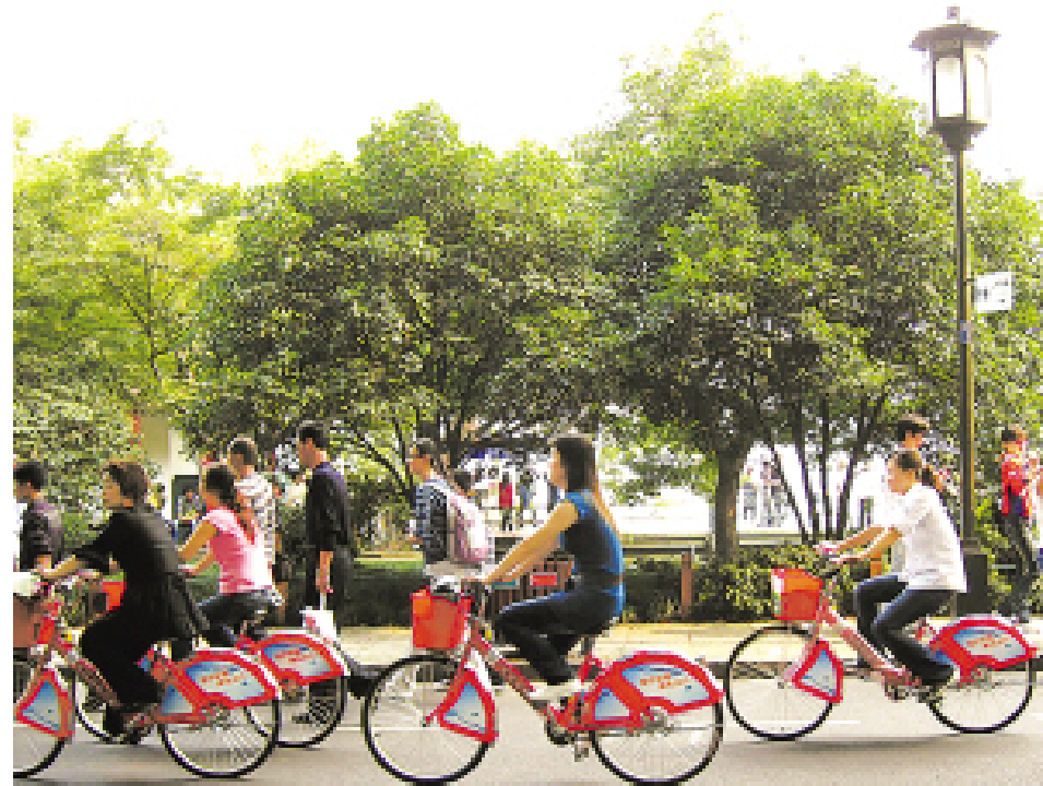
Bike rental system in Hangzhou