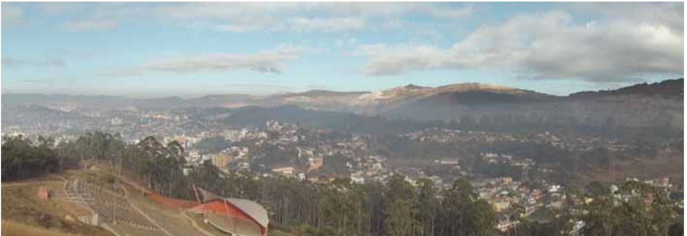
Figure 2. Photograph of the Pico do Amor landscape. Note the urban constructions, the reforestation with eucalyptus trees of part of the Pico and the iron ore extraction in the background.