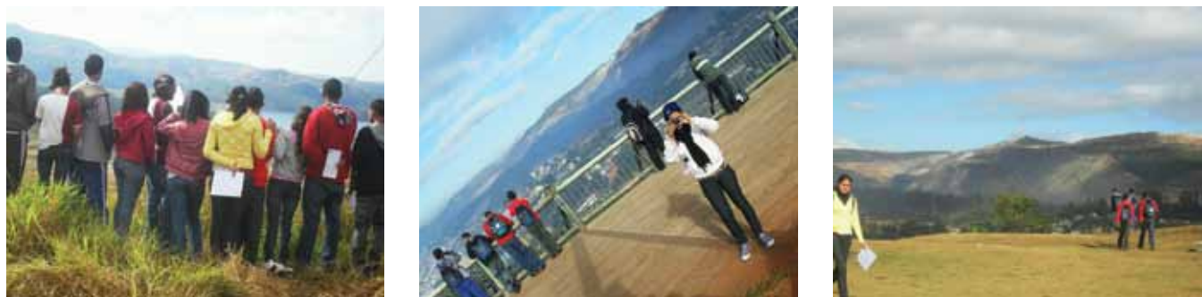
Figure 5. Site photographs.

this, it can be seen that the scale is very useful for quantitatively highlighting subjective and qualitative observations. The name of the scale is a homage by one of the participants in the project to the poet Carlos Drummond de Andrade, who lived through and suffered alterations to the landscape of a city that experienced the devastating power of mining companies 5 . It is worth highlighting that the largest scale landscape alteration perceived by the illustrious poet and by the oldest inhabitant was the complete destruction of the Pico do Cauê, nowadays called the Cauê mine—which is a large opening in the ground with a width and depth of several metres, and which can be easily seen from the “Morro da Pousada” viewpoint that was visited.