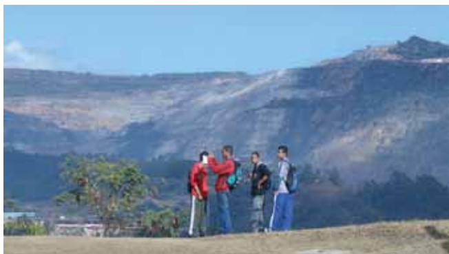
Figure 6. Site photographs.