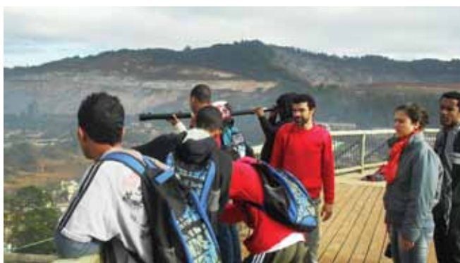
Figure 8. Site photographs—The History, Science and Geography teachers and students.

guidelines referring to environmental degradation and changes to the city's ecology and landscapes. Based on the landscape aspects available on the form, students were given the task of noting which aspects had suffered alterations and to what level.