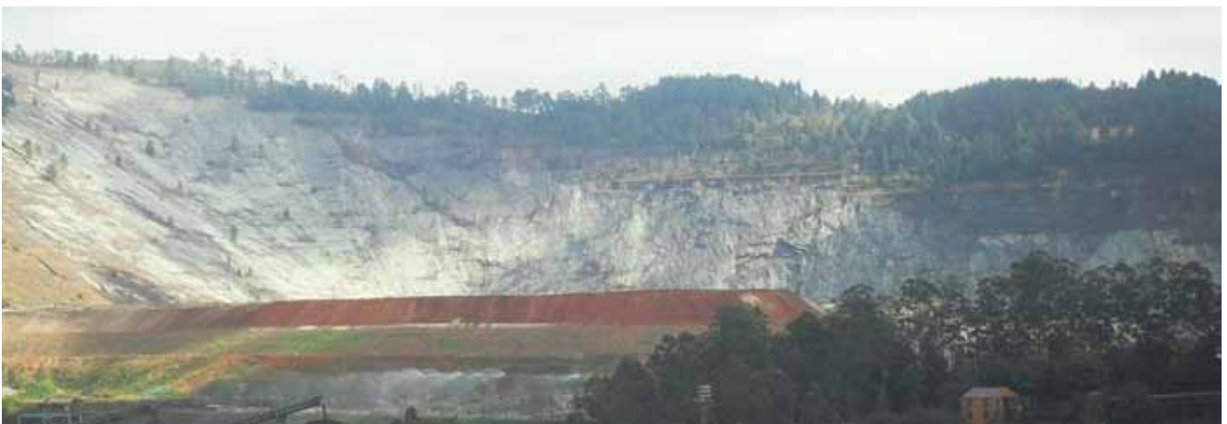
Figure 3. Photograph of the Morro da Pousada landscape. Note the old Pico do Cauê excavation and the ore industry in operation.

word to describe the landscape observed at each viewpoint. The words were: