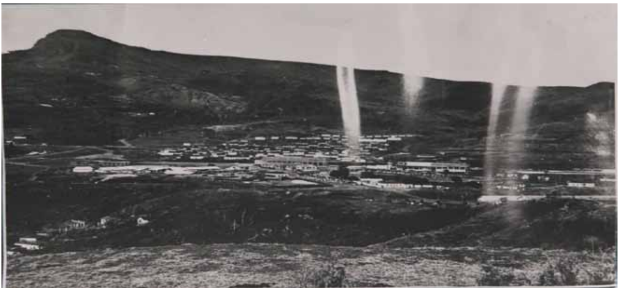
Figure 4. Old photograph of the Pico do Cauê in 1932, before mineral extraction.

place an emphasis on the practical and statistical gains that the task contributes to the research.