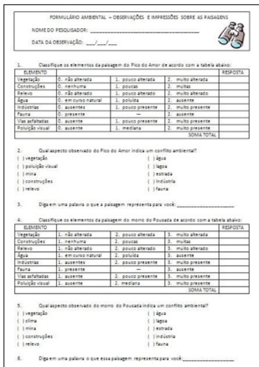
Figure 1. Example of the “Environmental Form”.

as a result, reflects the expectations, the demands and the ecological problems of the situation in Itabira 3 . This phase also included investigation work on the matter, distributed among the students. The fieldwork organisation team also worked on obtaining the equipment necessary to make observations of the landscape and to record the activity, such as compasses, binoculars, digital cameras, etc.