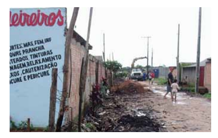
Makeshift Water Lines Improvised by Community Residents