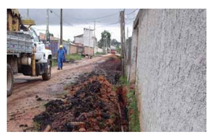
Implementation of Formal Water System.