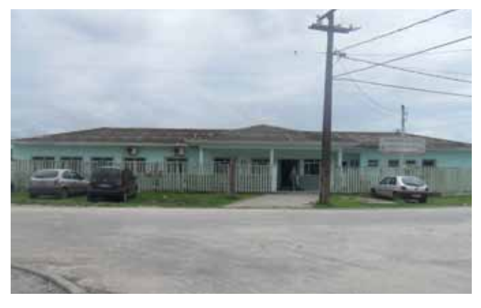
Day Care Center, capacity for 150 children.