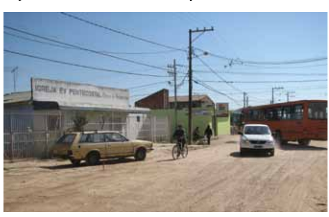
Implementation of Formal Water System