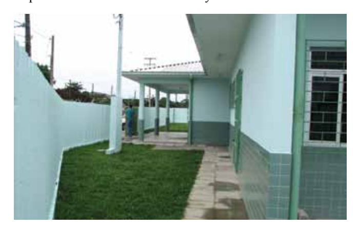
New Health Care Center