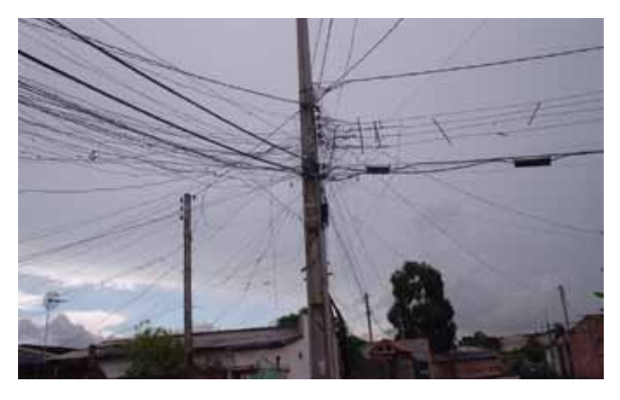
Makeshift Water Lines Improvised by Community Residents