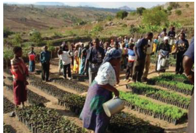
Figure 4. Farmers demonstrating village nursery operations.

in Salima district, as were overall yields (Figure 3). Both yields and the agroforestry effect were less in Mzimba and Machinga districts. Of the eleven districts participating in the AFSP, the eight most active were recommended for a planned second phase of the project: Dedza, Lilongwe, Thyolo, Karonga, Machinga, Mzimba, Mulanje and Salima.