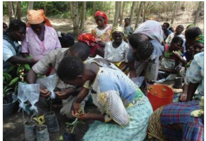
Figure 3. Women being trained in tree management.

184,463 farmers were reached through the project (Table 1), and these farmers saw increases in maize production thus contributing to improvement in household food security and nutrition (Figure 3). According to an external review of the project, the main strength of the AFSP is its relevance to the Malawi Growth and Development Strategy, the Agricultural Sector Wide Approach as well as the Millennium Development Goals. The review also concluded that the project has: (1) improved household food security and nutrition; (2) strengthened partnerships among stakeholders; (3) built capacity of farmers and extension staff; and (4) mainstreamed agroforestry in university curricula and cross cutting priority areas including gender equality, governance and HIV/AIDS. An assessment of impact of the project in terms of maize yield was conducted across six districts. The results show doubling of maize yields with the addition of agroforestry to the cropping systems (Mwalwanda et al. , 2012). One factor that facilitated team-building and team-oriented operations among disparate governmental and non-governmental partners in this project was the relevance of agroforestry to efforts by the Malawi government and local and national NGOs to develop agriculture and protect the local agro-ecosystems.