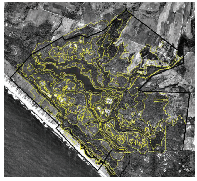
Figure 2. Linkage mapping of vegetation in the Conquista Campesina Community

As a result of the above, 198 GPS points were taken, accompanied by 297 photographs. Each point is accompanied by an average of 1.5 photos and an expert description provided by a mangrove forest specialist. The linkage mapping was executed after the first run.