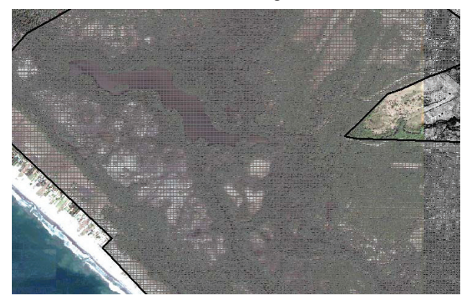
Figure 6. Grid for selecting the sampling units

To make the selection, the Rand function in the Microsoft Office Excel 2003 Programme was used, which returns a random number equal to or greater than 0 and less than 1. Since the Rand function has a range of 0 to 1, each identification number had to include a certain range between 0 and 1.