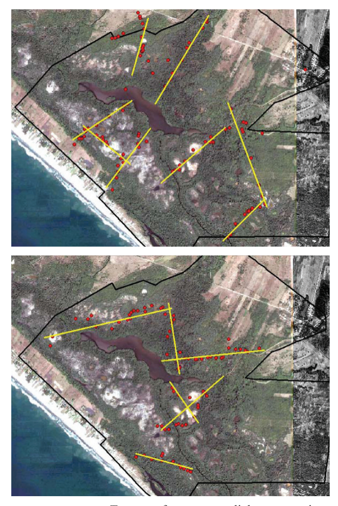
Figures 1a and 1b. Transects for mangrove linkages mapping

Most of these subjects were imparted in theoretical and practical sessions organised in the same areas in which the sampling was done, for the purpose of allowing the brigada to become familiar with the botanical, hydrological and topographical conditions of each site and identify potential limitations.