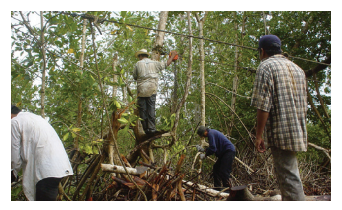
Figure 12. Procedure for rehabilitating natural ponds and water channels

<u>Rehabilitation of water flows in natural channels and ponds</u> (water medium): this activity does not include the building of structures in the area. Its execution is aimed at restoring the natural dynamics of the water column (flows and reflows). No major machinery is used in designing and executing the work, but tools with a low impact, such as large knives, pulleys and ropes. The strategy consists of mechanically removing submerged wood from natural ponds and water channels. To that end, the local inhabitants are divided up into work brigades, with the mission of identifying areas of the channels that are partially blocked, and one of the brigades explores the water medium in order to identify the logs and branches that must be removed. That waste is moored and lifted using pulleys with a capacity of one ton and a half (Figure 12).