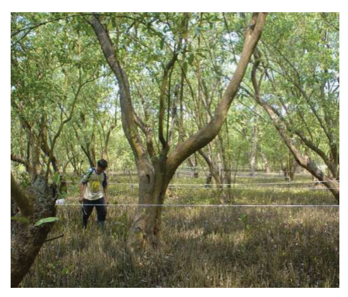
Figure 9. Establishing of sampling units

The whole of the sampling unit has a surface area of 300 sq metres (10 X 30; Figure 9), subdivided into 3 units of 100 sq metres (10 X 10). All the mangrove tree trunks (adults) in this subunit were surveyed. In each subunit, another division was established of 5 X 5 metres in which a count was made of the saplings and lastly, 4 more divisions were made of 1 X 1 metres for counting the seedlings.