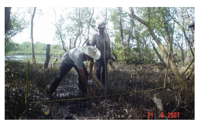
Figure 13. Rehabilitation of "ditches"

Rehabilitation of natural ponds or "ditches": this activity is designed to rehabilitate natural water channels known locally as "ditches", which are partly or totally blocked by accumulated sediments. The entry of these channels into the area is the main cause of the death of the mangroves due to the hypersalinisation and pyritisation of the water and soil. The poor circulation of the water gives rise to the stagnation of surface run-off water, which tends to disappear during the dry season, leading to the concentration of large quantities of mineral salts in the area. To reverse this effect, works are designed to open up natural "ditches" in order to recover the correct flow of tidal waters and prevent water stagnation. To execute such work, the former water "veins" are identified and the sediments are removed and retained at both sides of the channel through the construction of barriers (palisades) with dead vegetable matter (branches and logs, see Figure 13 and 14).