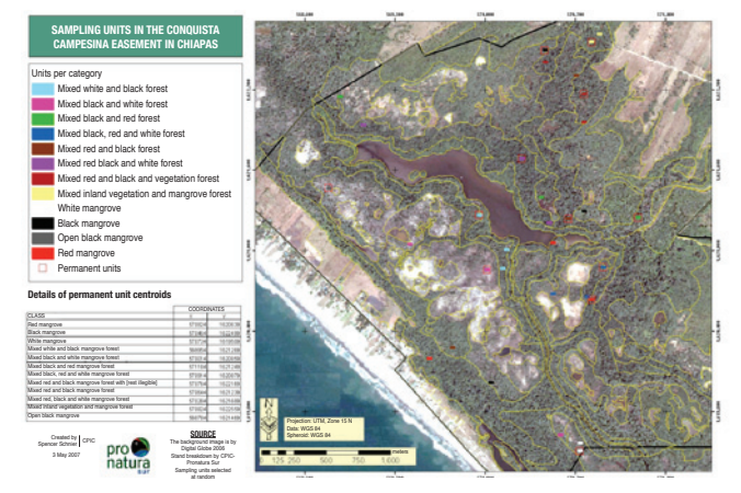
Figure 7. Sampling Units for monitoring the Conquista Campesina Conservation Easement Mangrove

The result of the foregoing was a total of 36 sampling units (three for each type of vegetation). For each group of three, another random selection exercise was performed in order to select a sampling unit for each type of vegetation, for monitoring on a permanent basis. Figure 7 shows the 36 sampling units, 12 of which have a square identifying those which will be established and monitored over several years, to obtain the necessary information for adapting and fine-tuning the plan for handling the region.