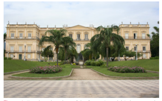
Figure 1. Façade and gardens of the former Imperial Palace, now the National Museum

science with research by including research laboratories and offering post-graduate courses under Latin America's leading scientists. About three thousand exhibits are on view to the public - just a small part of the thousands of items in the museum's science collections. The Museum also has a botanic garden and central library (Brazil, 2008). Figure 1 shows the façade of the former Imperial Palace, now the National Museum.