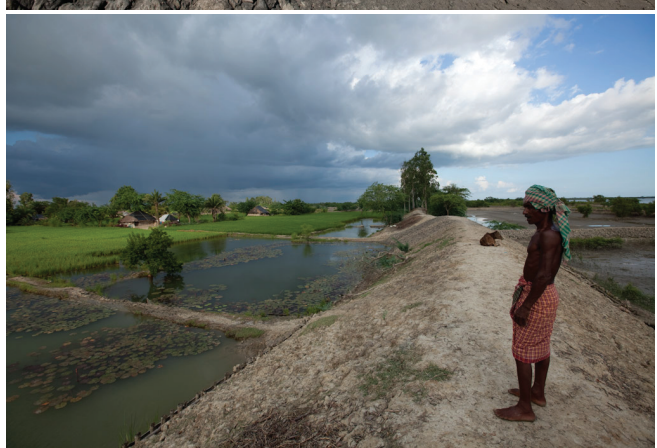
Figure 1a. Embankment ©hellio-vaningen 1b. Construction of embankment ©hellio-vaningen

Thus in present situation identification of stable, accreting lands for afforestation is a key task.