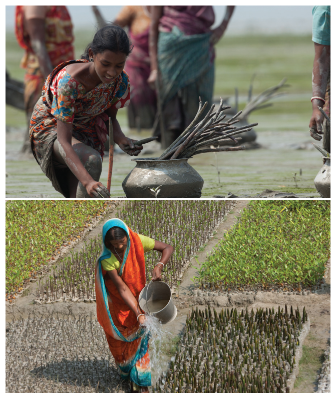
Figure 3a. Replanting Chellio-vaningen 3b. Watering plantations Chellio-vaningen

The sites were on 'charlands' i.e. islands that emerged in the siltation process and also narrow but continuous patches along the mudflats that acted as 'bio-shield stretches'.