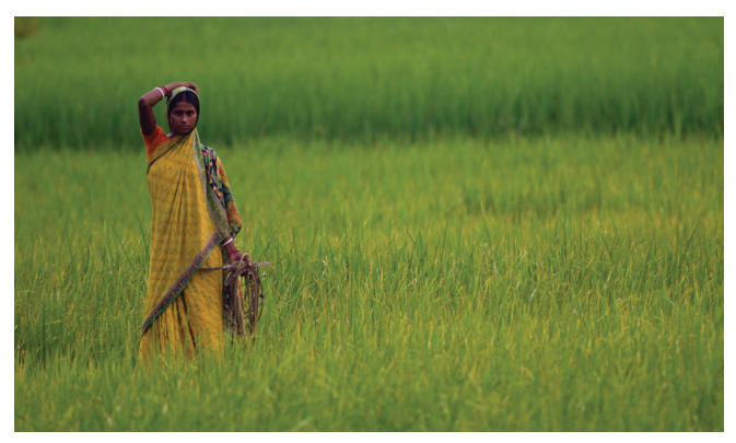
Figure 2a. Fisherman ©hellio-vaningen 2b. Woman in a rice field ©hellio-vaningen

The Government has taken intense programme on generation of income through self-help groups and it appears from researches in post-aila period that the dependence on unsustainable use of ecosystems resources has increased. The general condition of life has not improved rather it appears to be more critical with shrinking agricultural options esp post-aila period when the soil was under saline cover and the regular paddy yields decreased, scarcity of freshwater resources adding on to the woes of people. The fish catch has also remarkably reduced and changed with commercial catch decreasing (Mitra et al, 2009). Post-Aila period man-animal conflict