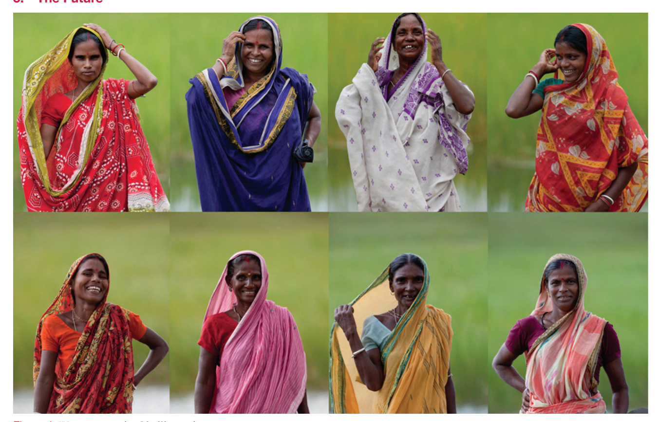
Figure 4. Women portraits

To extend this business model further into forest and wetland conservation projects, the REDD+ is a good mechanism that gives enough scope not only to restore degraded lands but also prevent further degradation of forested lands. However