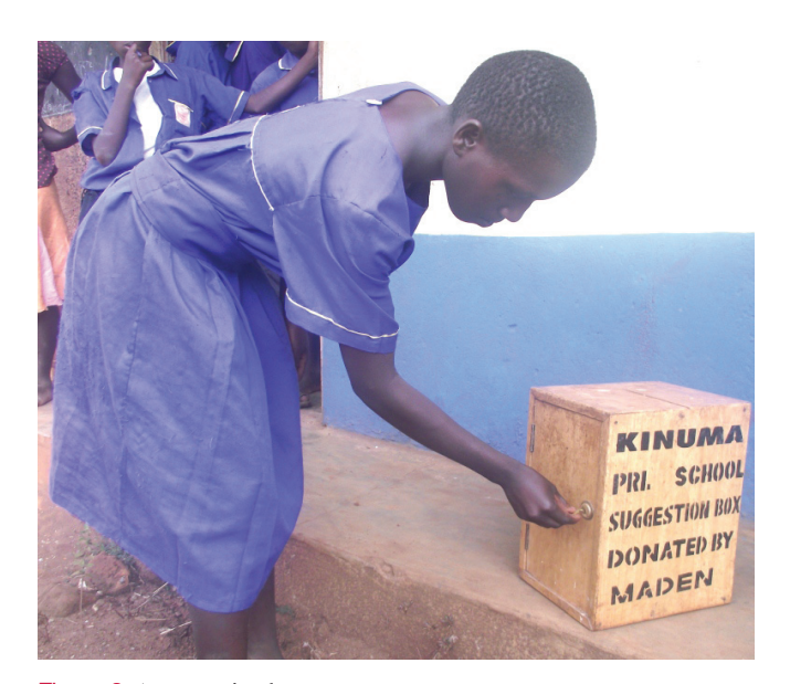
Figure 3. A suggestion box