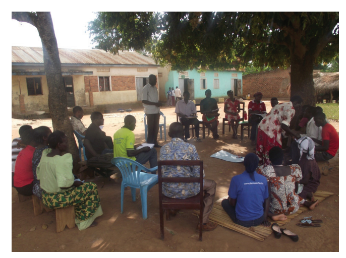
Figure 2. A reunion of community members

raised include lack of transparency and accountability in the delivery of agricultural services. Other issues include the failure to disclose budgets; the distribution of seeds at night to friends and relatives; and the distribution of sub-standard inputs and inadequate drugs at the public health center and failure to provide health outreach.