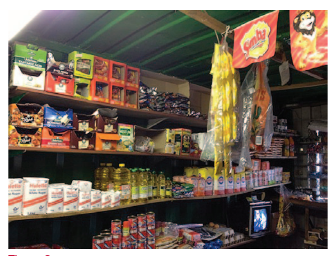
Figure 2. Sugar, maize meal, cooking oil and flour account for most sales in value

owners face heavy competition from highly successful migrant traders: Over the past 15 years, immigrants from other parts of the continent, especially Somalia, Ethiopia and Tanzania, as well as South Asia (mainly Pakistan and Bangladesh), have opened thousands of spaza shops around the country. These traders leverage informal financial networks and social capital with business skills acquired over generations, and are competing fiercely with local traders on price.