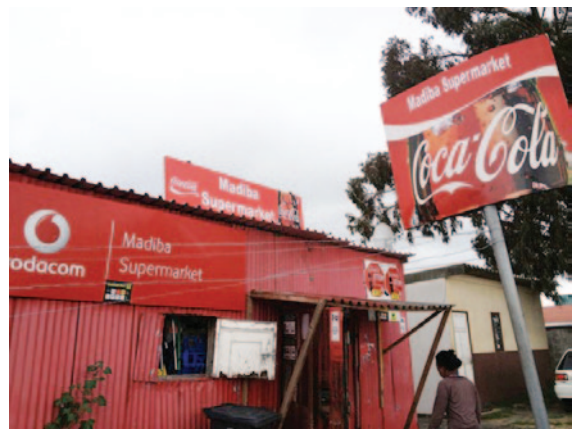
Figure 1. Entrance of a self-service spaza, Khayelitsha

enter into partnerships or formal agreements. Such entrepreneurs, and the economic ecosystem in which they function, are excluded from the formal economy.