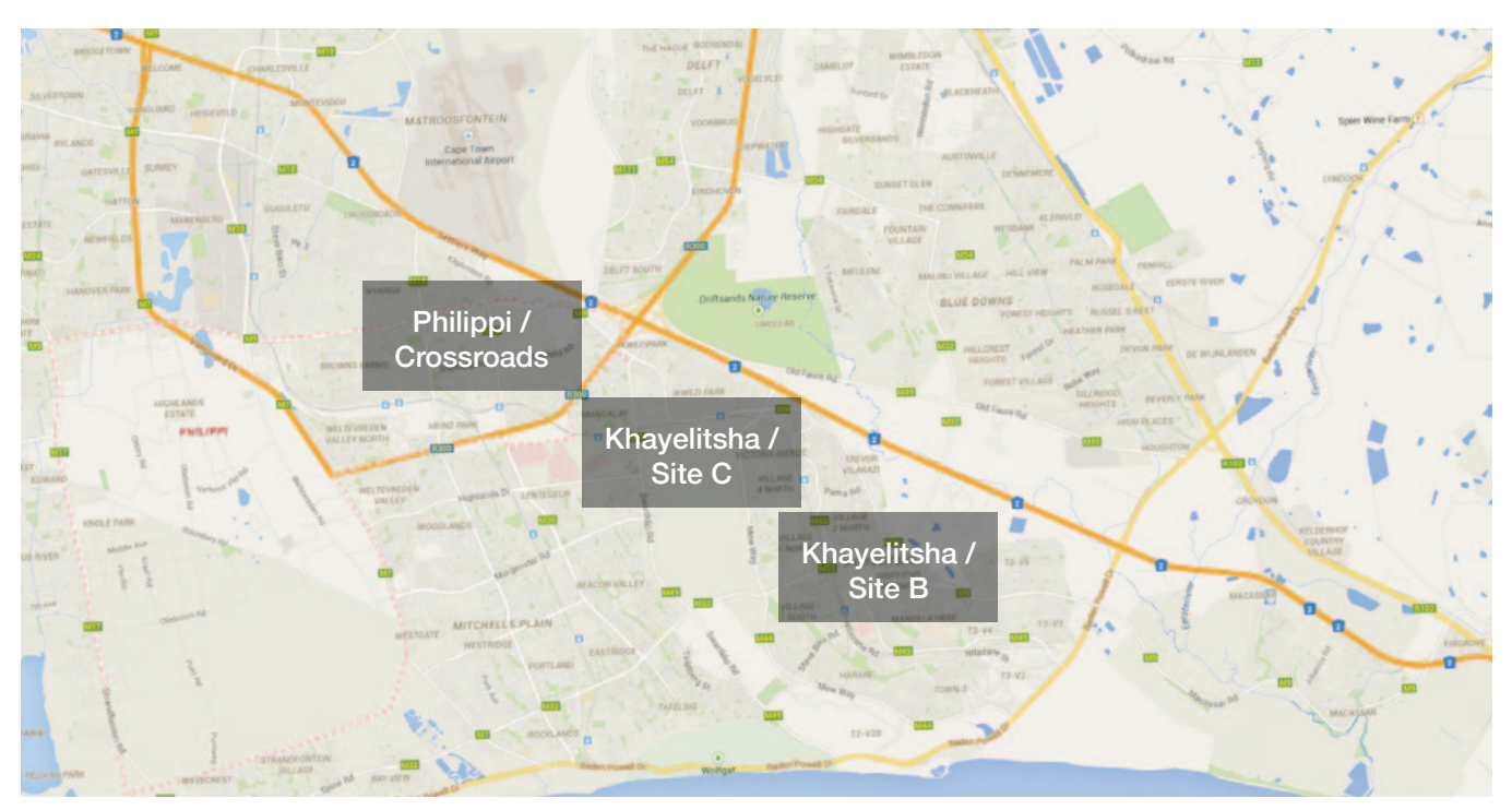
Figure 4. Area detail of Cape Town's Philippi, Nyanga and Khayelitsha townships

Sekulula's financial outflows were mainly made out of operational costs such as vehicle finance, maintenance, fuel, insurance and a salary for the drivers.