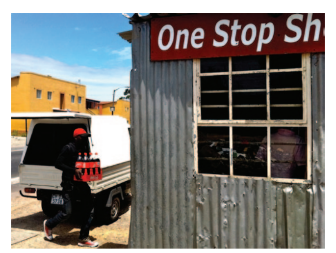
Figure 5. Delivery in progress, Nyanga