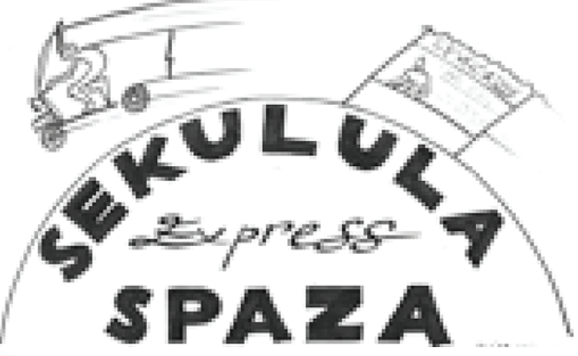
Figure 3. A logo and brand was developed during the pre-field phase

The pre-field surveys and focus groups helped Reciprocity to establish a set of independent variables that each play a role at one step along the value chain. These variables were each likely to influence the outcome of the pilot, and each was linked to a specific aspect of doing business in low income communities: