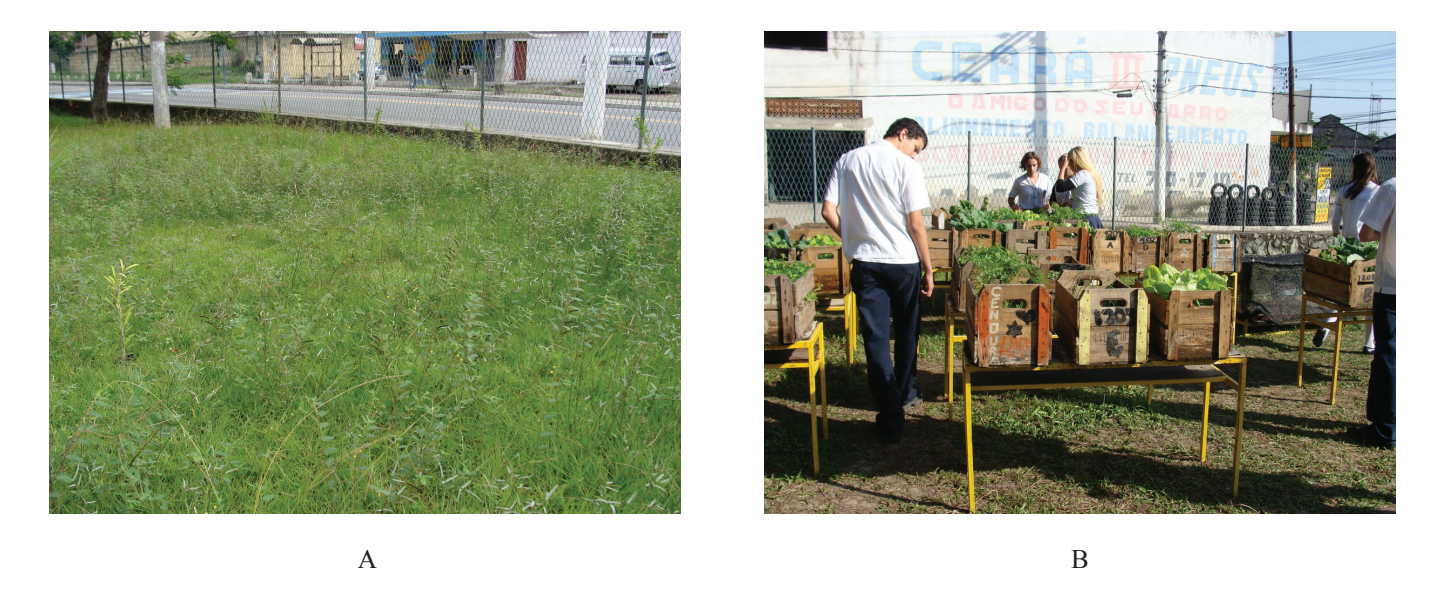
Figure 4. The area outside the school building modified by establishing the school vegetable garden. Space before setting up the crate garden (A), and the same space occupied by cultivation (B).

Declarations from pupils who participated in the Cultivate Project indicated an interest in and awareness of the need for actions within this context. Examples are given as follows: