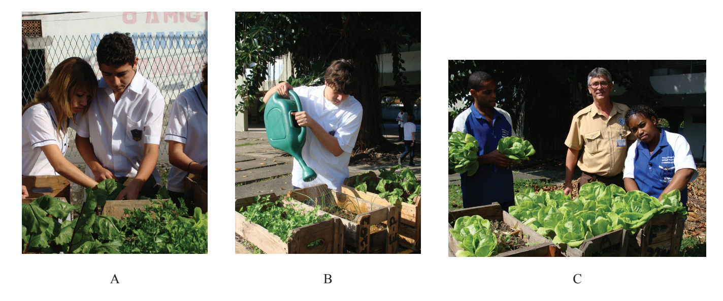
Figure 3. Pupils cultivate the school vegetable garden in crates and employees participate in the harvest.

on how they accept the relevance of such actions to their lives. Despite the contradiction identified by the questionnaire, the pupils did not readily see themselves as contributing towards environmental degradation. This probably relates to the difficulty in changing habits, since usually we only change if we acknowledge the need to change our attitudes, unless we are forced to do so. These findings also suggest that individuals also find it difficult to identify themselves as agents of environmental degradation. There is still resistance towards recognizing the importance of individual actions in achieving collective results, thereby contributing towards improving environmental conditions. For Jacobi (1997), it is necessary to create new attitudes and behavior given our society's consumption and to stimulate changing individual and collective values. This is reinforced by Sorrentino (1998), who sees the major challenges facing environmental educators as, on one hand, restoring and developing values and behavior (trust, mutual respect, responsibility, commitment, solidarity and initiative), and on the other hand, stimulating an overall and critical vision of environmental issues and promoting an interdisciplinary focus on restoring and building knowledge.