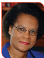
Mamphela RAMPHELE Former Managing Director of the World Bank