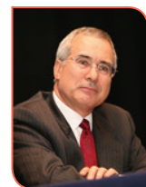
Nicholas STERN Lord, President of the British Academy, Professor at the London School of Economics