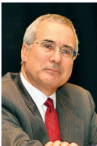
Lord Nicholas Stern Lord, President of the British Academy, IG Patel Professor of Economics and Government at the London School of Economics, Fellow of the Royal Society

The Foresight Committee’s meetings give the Institute the opportunity to validate ongoing projects, identify new foresight topics, and develop its working areas thanks to the insights of the participating experts and their in-depth knowledge of their fields.