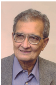
Amartya Sen Economist, Nobel Prize 1998, Thomas W. Lamont University Professor and Professor of Economics and Philosophy at Harvard University