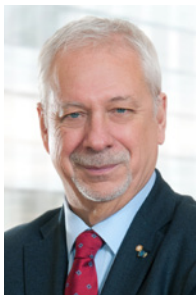
Pierre-Marc Johnson International lawyer, former Prime Minister of Quebec, Chair of the Foresight Committee