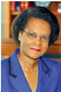
Mamphela Ramphela Former Managing Director of the World Bank, Former Vice-Chancellor of the University of Cape Town