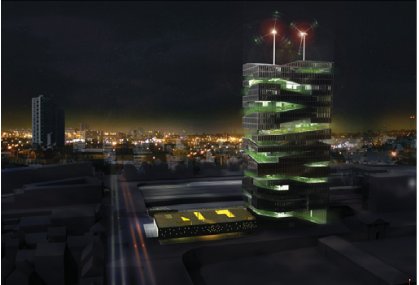
The Living Tower is an urban vertical farm concept associated with a residential and business campus

rainwater, contributing to the decrease of clean water usage and waste. Further, solar panels could integrate buildings, especially in regions of the world where solar light is constant and abundant throughout the year.