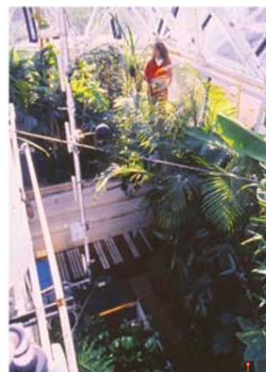
Test modules of closed ecological systems from the Biosphere 2 experiments. Construction for the project started in 1987 and the first mission began in September 1991.