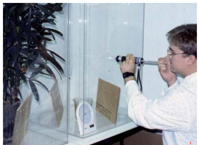
Plexiglas test chamber used in the experiments conducted by Wolverton Environmental Services, Inc.