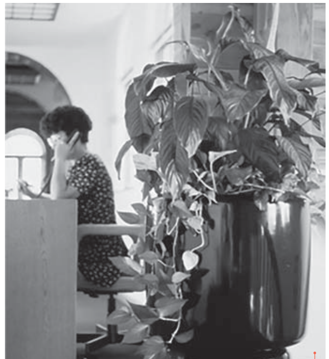
Prototype unit used in the Mission Control building of the Biosphere 2 project.