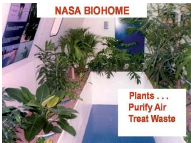
Interior view of the Biohome.